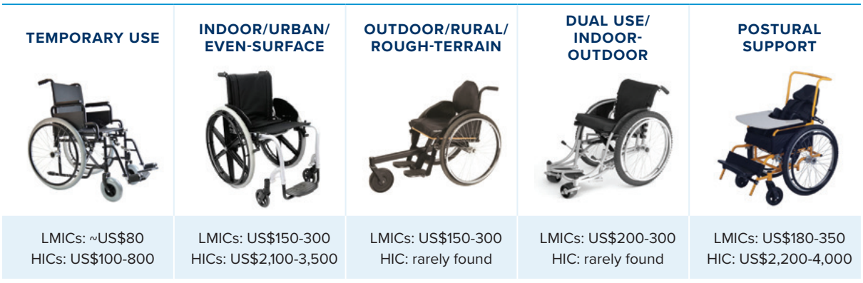
TABLE 2: EXAMPLES OF WHEELCHAIRS FROM EACH CATEGORY AND INDICATIVE PRICING<sup>15</sup>