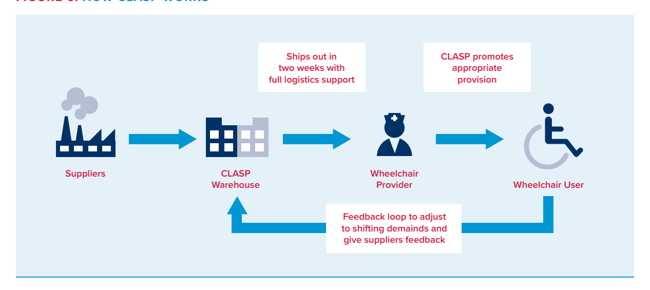
FIGURE 6: HOW CLASP WORKS

While CLASP exemplifies the advantages of a global distribution hub to building and supplying demand for optimal, quality product, it has not been without challenges. CLASP buyers are primarily NGOs and USAID-funded programmes and procurement volumes have been low. Additionally, CLASP has seen limited success in accessing and responding to government tenders due to tender regulations and practices. The low procurement volumes limit availability of working capital to purchase products for warehousing and limits the ability of CLASP to take full advantage of pooled volumes and economies of scale. For example, as CLASP is not the exclusive distributer for suppliers, suppliers have sold directly to buyers below the manufacturer suggested retail price offered by CLASP and therefore, CLASP is perceived as having more expensive products.