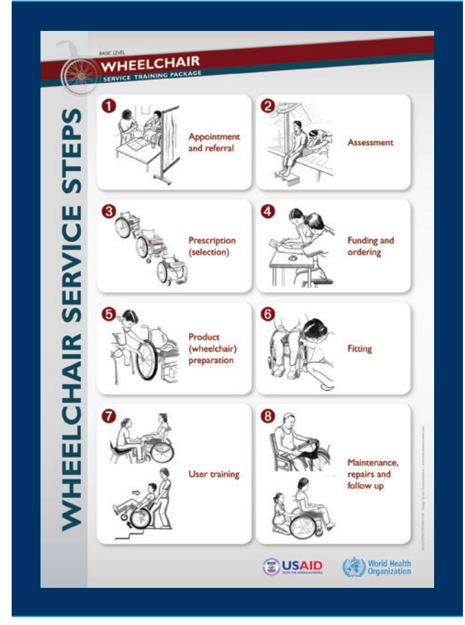
FIGURE 3: THE WHO 8-STEPS TO WHEELCHAIR PROVISION

in order to develop effective and sustainable wheelchair service provision.<sup>19</sup>